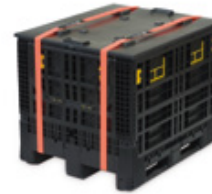
FLC (Folding Large Containers)